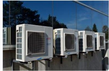
The rising global demand for air conditioning and refrigeration helped push through an amendment to the Montreal Protocol that will limit the use of hydrofluorocarbon refrigerants.