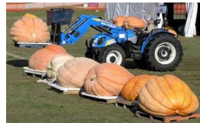
Roland, MB. Pumpkin Festival

Email: mopia@mts.net www.mopia.ca 1.888.667.4203